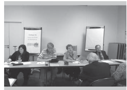
Annual General Meeting / Réunion générale annuelle