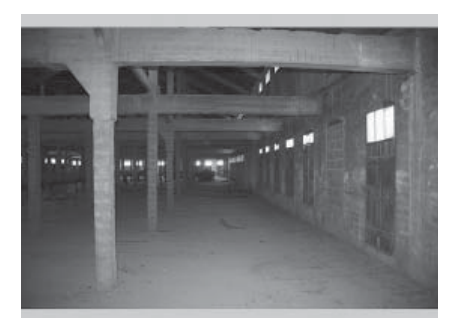
Camp des Milles