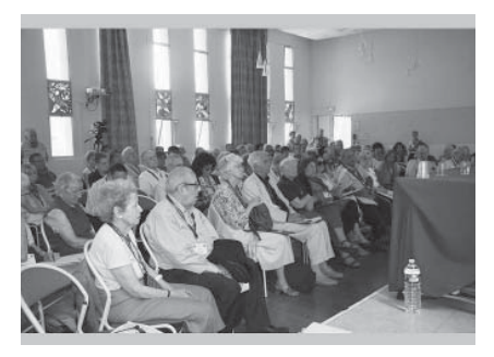
Opening Session / Ouverture